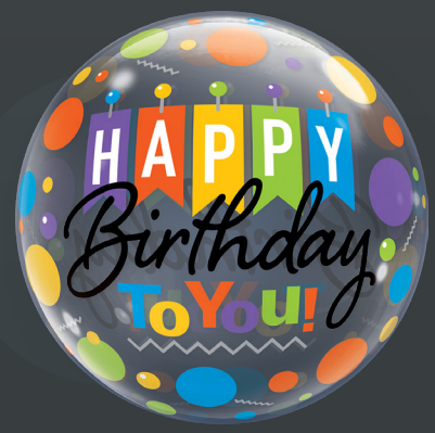
Birthday Banner #00024 22"