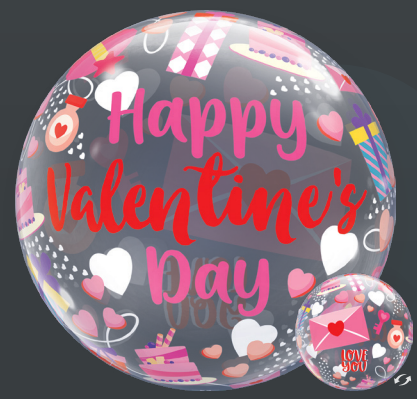
Everything Valentines #00037 22"