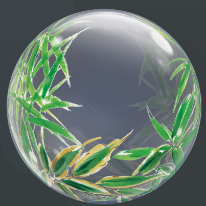
Kyoko Bamboo Leaves #00166 24"

*Deco Bubbles must be tied with ribbon or other material.