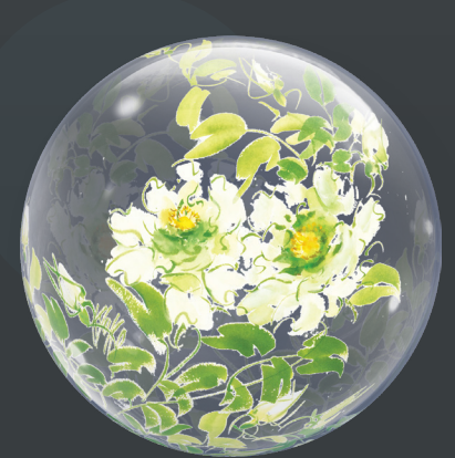
Kyoko White Rose #00167 24"