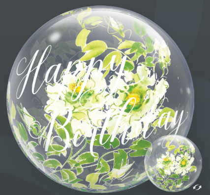
Kyoko Birthday White Rose #00165 22"