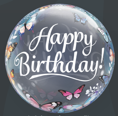
Birthday Soft Butterflies #00014 22"