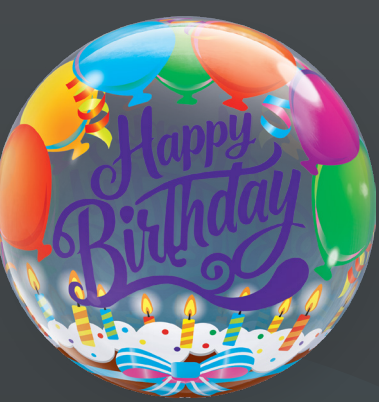
Birthday Balloons & Candles #00003 22"