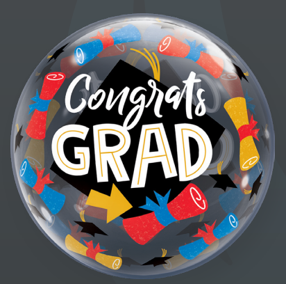
Congrats Grad #00041 22"