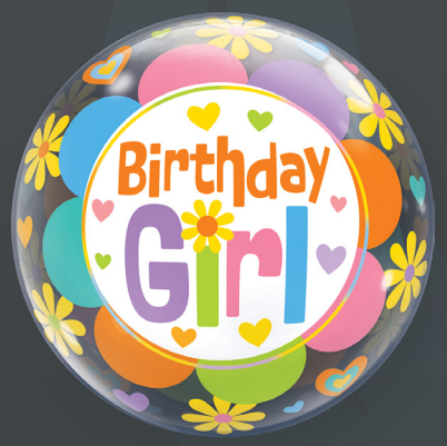
Birthday Girl Flowers #00022 22"