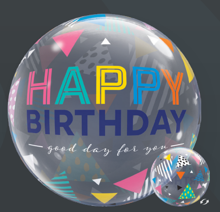
Birthday Rainbow Triangles #00016 22"