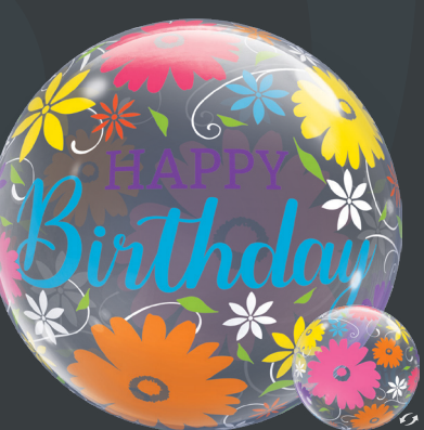
Birthday Flowers & Filigree #00010 22"