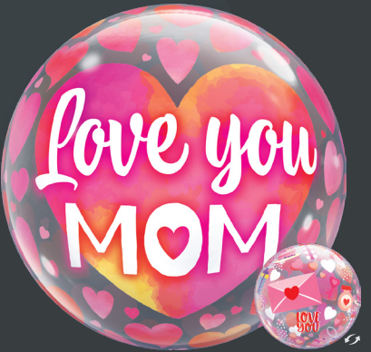
Love You Mom Pink #00043 22"