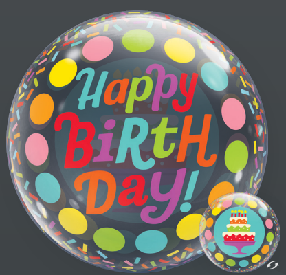
Birthday Cake & Colorful Dots #00021 22"