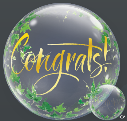
Kyoko Congrats Ivy #00164 22"