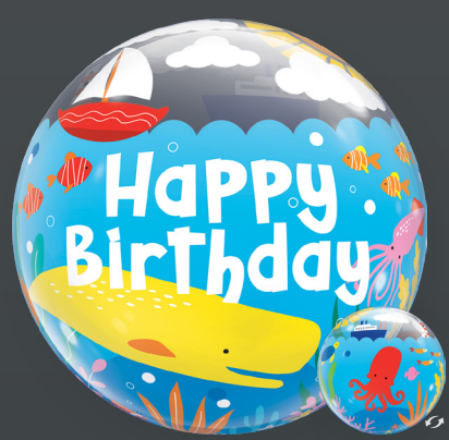
Birthday Maritime Fun #00020 22"