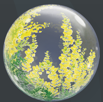
Kyoko Mimosa #00168 24"

For more detailed information of Kyoko Yamamoto, please visit