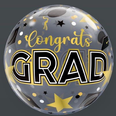
Congrats Grad Stars & Dots #00039 22"