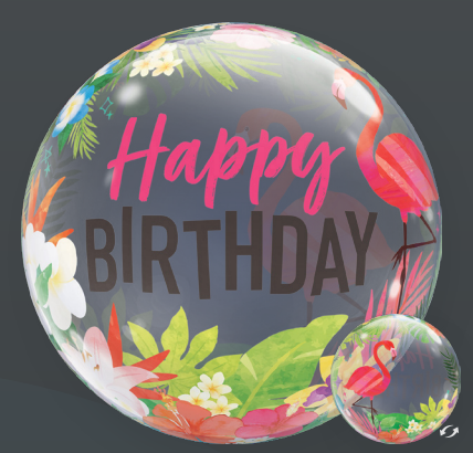
Tropical Birthday Party #00013 22"