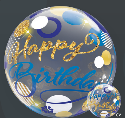
Birthday Blue & Gold Dots #00004 22"