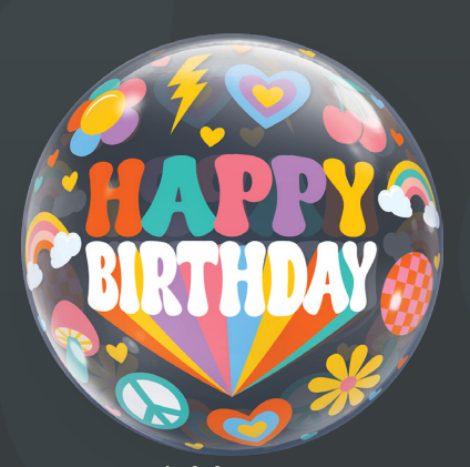
Birthday Retro #00023 22"