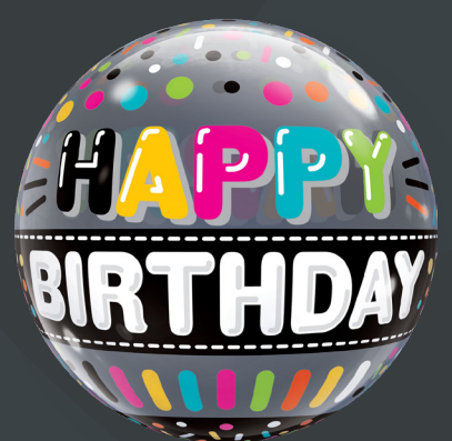
Birthday Black Band #00008 22"