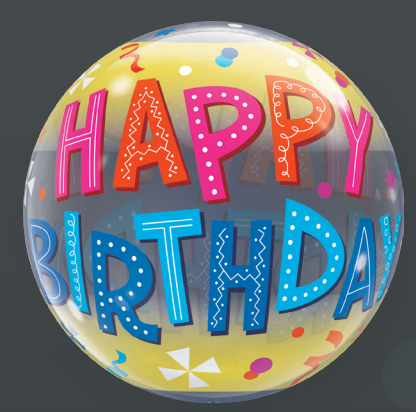
Birthday Fun & Yellow Bands #00012 22"