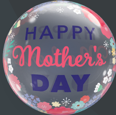
Mother's Day Floral Pastel