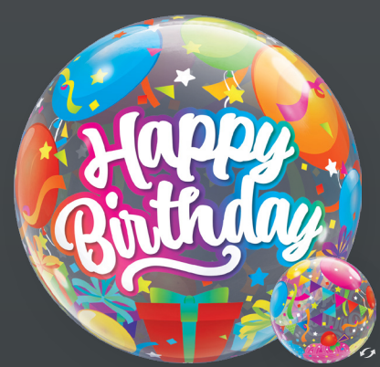
Birthday Surprise #00002 22"