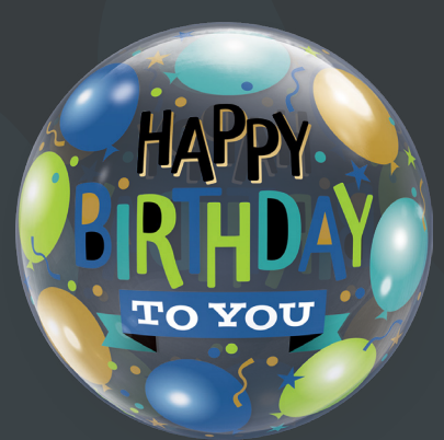
Happy Birthday To You #00026 22"