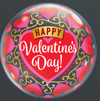
Valentine's Filigree #00038 22"