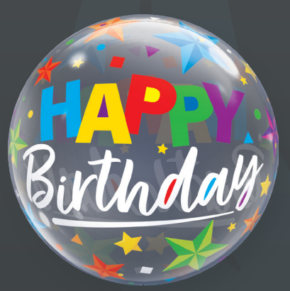
Birthday Brilliant Stars #00006 22"