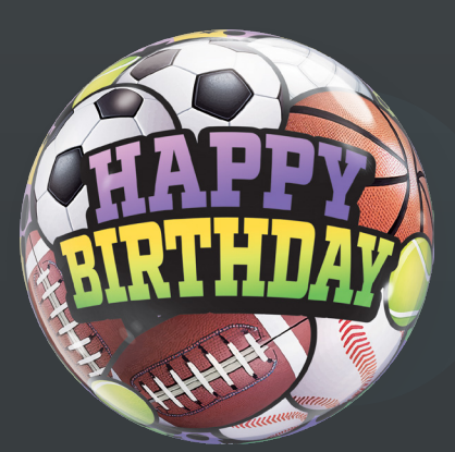
Birthday Sports Balls #00015 22"