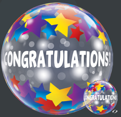
Congratulations Shooting Stars #00036 22"