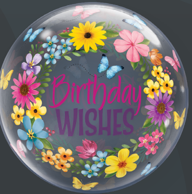
Birthday Wishes Floral #00025 22"