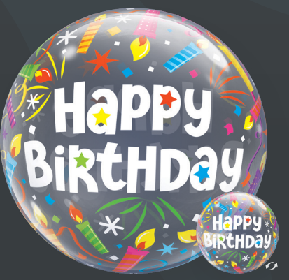
Birthday Lit Candles #00009 22"