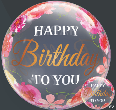
Birthday To You Pink Peonies #00018 22"