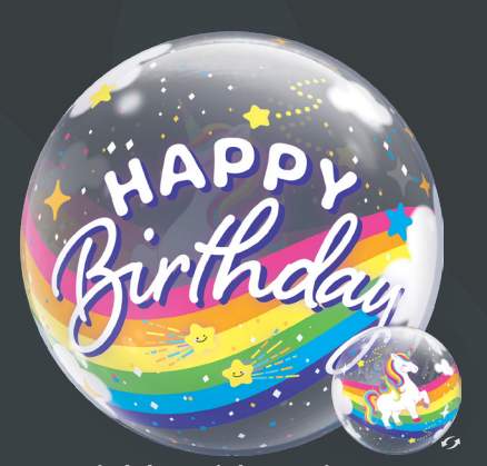
Birthday Rainbow Unicorn #00007 22"