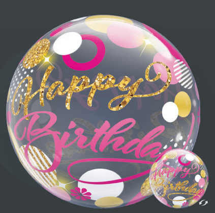
Birthday Pink & Gold Dots #00005 22"