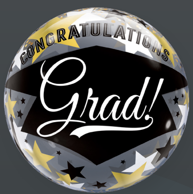
Graduate Black Stars #00040 22"