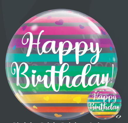
Birthday Bright Rainbow Stripes #00017 22"