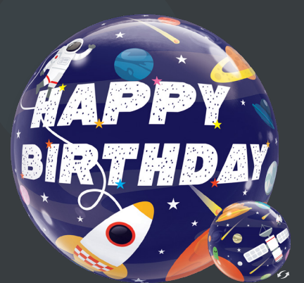
Birthday Outer Space #00019 22"