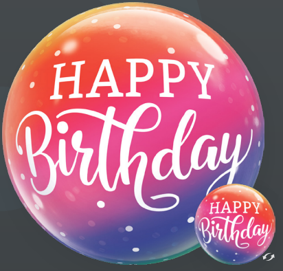
Birthday Ombre & Dots #00011 22"